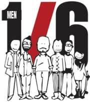
Someone in your group will one day be the victim of sexual violence

One in four women and one in six men are affected by this type of violence in their life. Sexual violence is principally perpetrated by men and women against children.